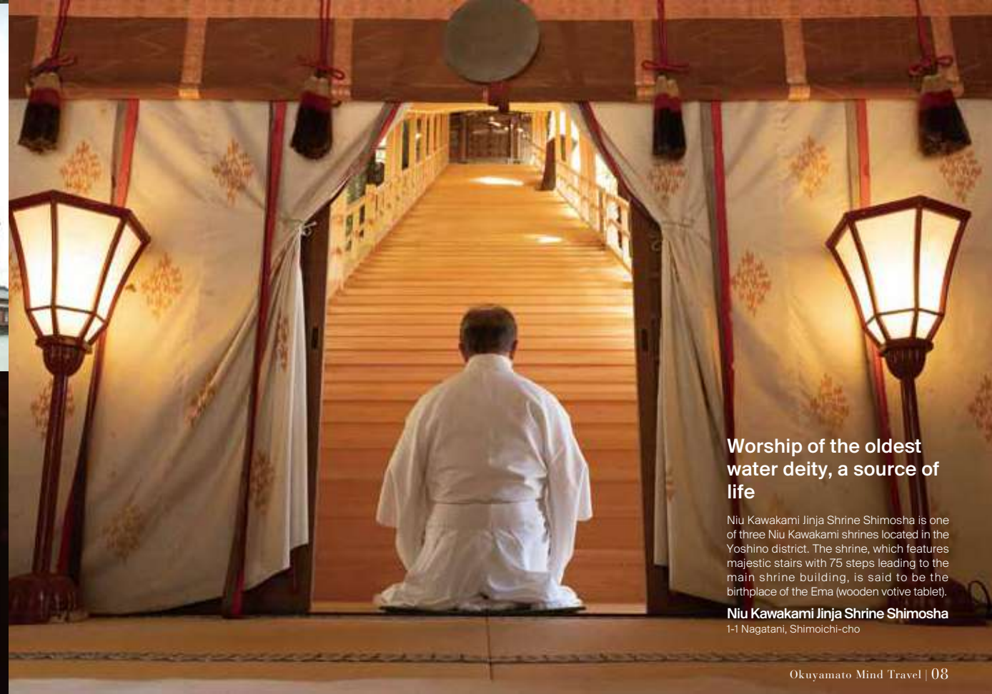
Worship of the oldest water deity, a source of life

Kinpusenji Temple 2498 Yoshinoyama, Yoshino-cho