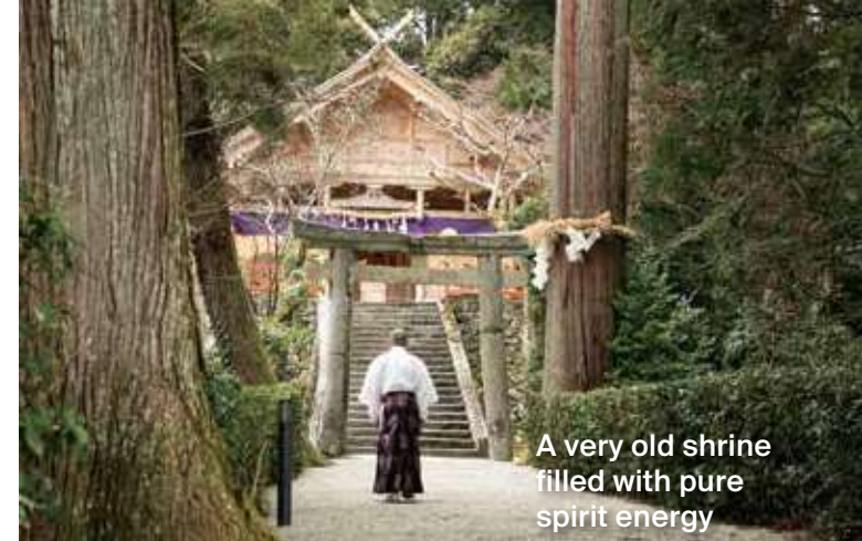
A very old shrine filled with pure spirit energy

Kou Jinja Shrine 347 Kojindake, Iketsukawa, Nosegawa village