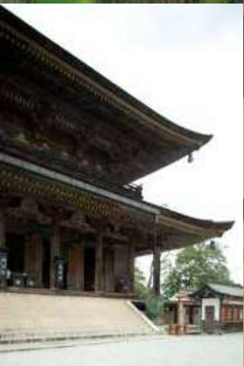
Head temple for Shugendo, a religion which regards nature as Shinto and Buddhist deities

Kinpusenji Temple is a symbol of Mt. Yoshino, a sacred land for mountain ascetic practices. The temple boasts a number of magnificent structures, including the Zendo Hall, which is reminiscent of nature, and the hidden statue of Zao gongen.