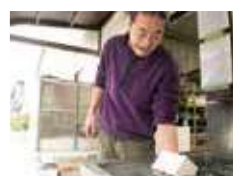
Meisui tofu Yamaguchi-ya 258 Dorogawa, Tenkawa village

Enjoy the rich flavor of wild boar meat.