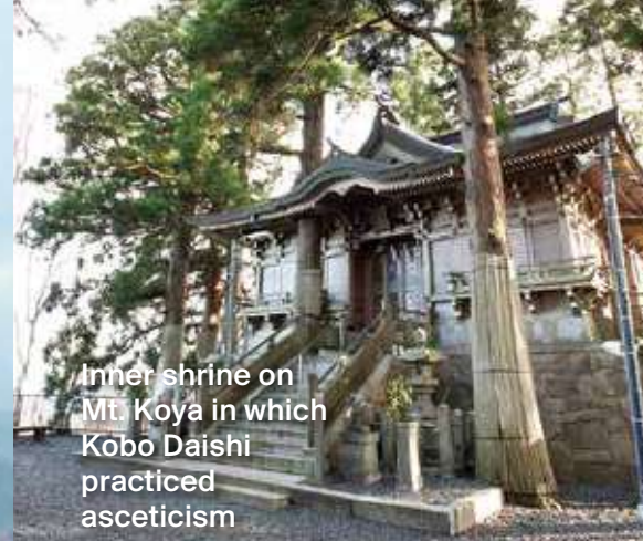
Inner shrine on Mt. Koya in which Kobo Daishi practiced asceticism

Kou Jinja Shrine, which worships Kamadogami (the tutelary deity of the hearth), features a path to the shrine with more than 170 torii gates and a hill commanding a beautiful view of Mt. Omine.